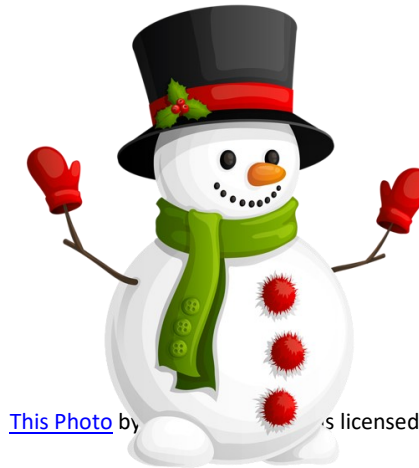
This Photo by [Name] is licensed