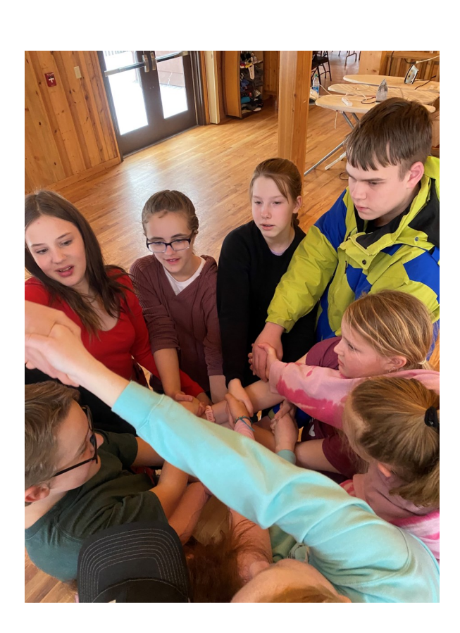
"Camp helped me grow religiously, mentally, and socially. Camp is a place where the judgement disappears." – Tess

"FLBC is a great place where you can truly be yourself." – Brisies