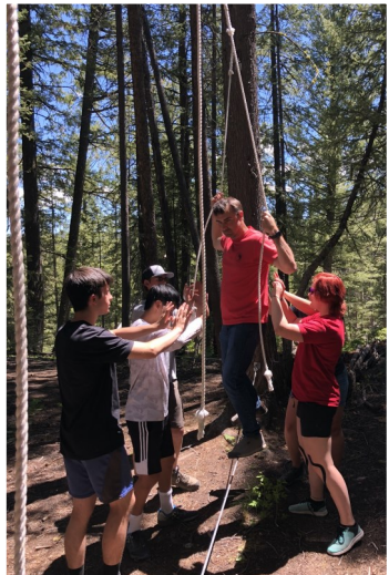
LOW ROPES COURSE