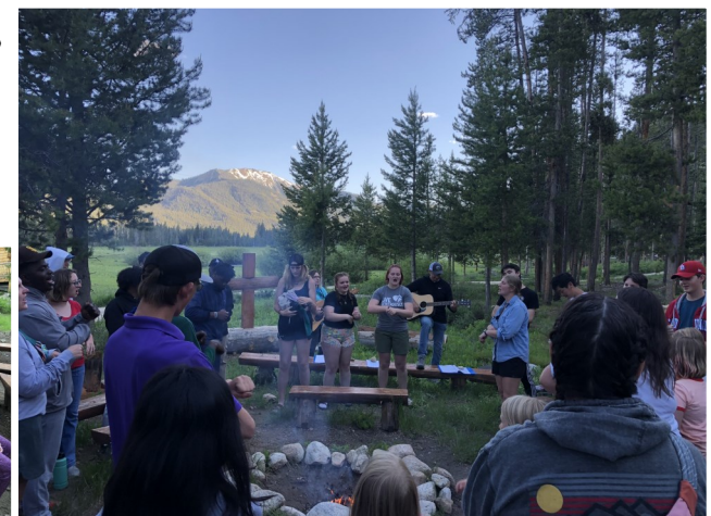
WORSHIP & BIBLE STUDY